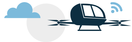
GRU Guarulhos International Airport São Paulo (Brazil)