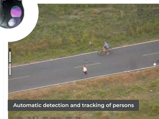
Automatic detection and tracking of persons