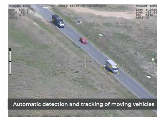
Automatic detection and tracking of moving vehicles