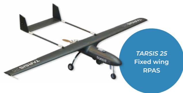
TARSIS 25 Fixed wing RPAS